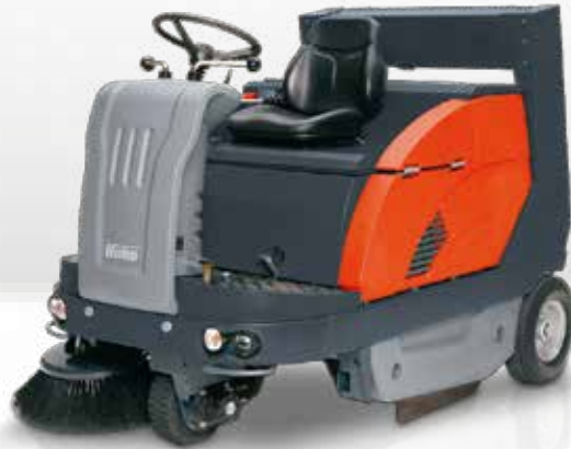
Sweepmaster P1200 RH