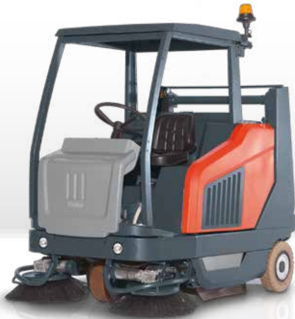
Sweepmaster P1500 RH with optional cab safety roof